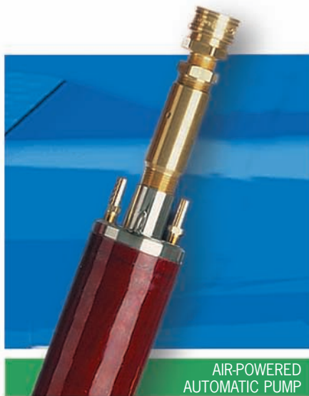
AIR-POWERED AUTOMATIC PUMP