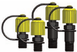
QED Wellhead Retrofit Kit Model: 40987 Kit includes: 4 barbs – 0.25" NPT, 2 long, 2 short

QED's Easy Port™ Fittings (Patent Pending) are made with tough, inert, fiber reinforced nylon, and they have a screw-on cap that seals tightly, making them bird-proof. The sample ports have heavy walls to reduce heat loss and freezing, and are UV protected for much longer field life. The cap seals tightly but can be easily removed with a simple twist, and it is tethered to the fitting so it cannot be dropped or lost.