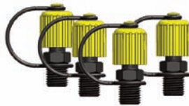
Non-QED Wellhead Retrofit Kit Model: 40986 Kit includes: 4 barbs – 0.25" NPT, 4 short