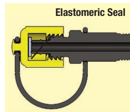
Leak-proof Elastomeric Seal Twist-on cap seals tightly reducing air leaks and resisting water buildup.