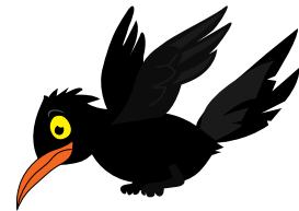
Bird-proof New twist-on cap seals tight, combine this with heavy-walled construction and the entire fitting is bird-proof.