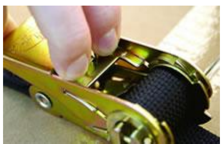
1. To release webbing, pull and hold release tab on top assembly to override ratcheting function.