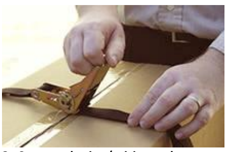
3. Start ratcheting (raising and lowering handle).