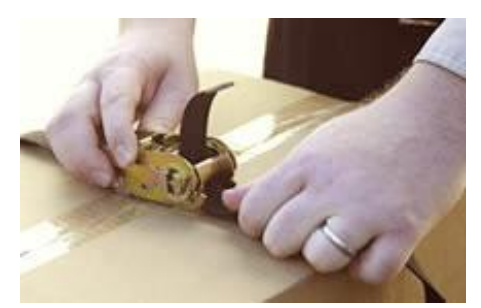
1. To thread ratchet buckle, place webbing THROUGH slot in center, rotating spool of closed ratchet.