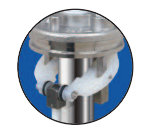
New and Improved Valve Stem Connection No fasteners; no cotter pins. Exhaust seat is easy to adjust.