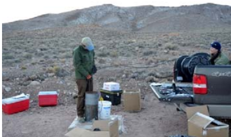
Dedicated QED deep-well sampling system being installed to 970 feet at high-elevation Nevada gold mine.

The need for collecting groundwater samples at these depths occurs very frequently in the arid western U.S. and Australia, and in mountainous areas such as Hawaii.