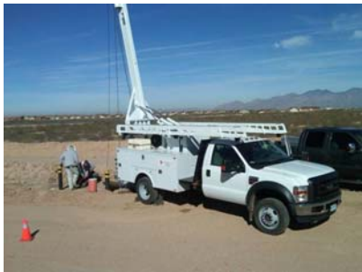
Typical Smeal rig required for deep-well Electrical Submersible Pump [ESP] sampling equipment operations.

Historically, sampling systems and methods for monitoring deep groundwater conditions have required elaborate, expensive approaches because of the requirement to purge multiple volumes from the well prior to sample collection. This high-volume purging method also has the potential to mobilize particles from the sediment, meaning samples are not representative of the true groundwater conditions, and false positives in the analytical data can cause compliance issues. Collection and disposal of purge water add to the cost of this approach; some wells can generate hundreds to thousands of gallons of purge water, and require numerous labor hours from multi-person crews. It is not uncommon with this conventional sampling approach to see costs for sampling a single deep well run to $15,000 or more per well, per sampling event.