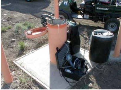
Integrated MicroPurge ® portable surface controls deployed at a wellhead in California. Note the 20-gallon drum for generated purge water from multiple wells.

QED collects all the well data, including water chemistry, for a given site in advance of finalizing a quote or filling an order. We measure, precut, and preassemble each dedicated deep-well system in a clean room facility to the specifics of not just the site, but for each individual well – it's a huge savings in cost of materials as well as in the installation time and labor for the customer. QED understands the pros and cons of different approaches, materials, and operational methodology. We propose our recommendations for the application along with any alternatives and their associated costs. QED teams with the engineers and the end-user to deliver the best engineered value, not just the lowest cost. The system also includes our field-proven, value-added engineering expertise that starts with the initial inquiry and is available for the life of the project.