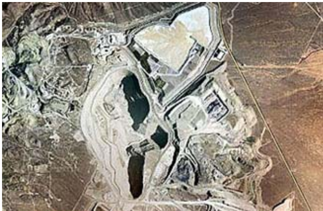
Cortez Gold Mine, Lander County, Nevada.

QED Environmental Systems has recently been working with mine operators to sample a coal seam fracking site in Australia. Samples must be collected from more than 3,500 feet below the surface. The water is significantly hotter than the usual groundwater site, adding complications. Sampling is performed by a dedicated bladder pump located at a depth of 300 feet; water is brought up to that level from the deep coal seam via a drop tube under hydrostatic pressure. The system is equipped with Teflon tubing to withstand the high temperature of the sampled water; a stainless steel cable provides additional support for the downwell components.